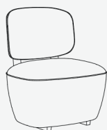
Individual 590 x 565 x 810