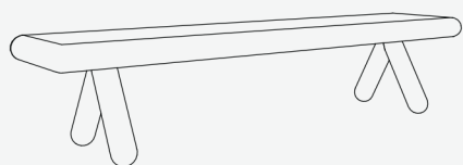
BBK - Stool